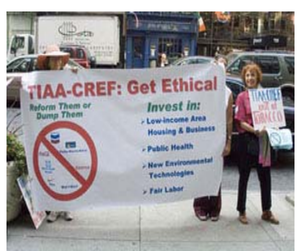
Join forces to "Make TIAA-CREF Ethical" Go to: http://maketiaa-crefethical.org/

Photograph and press release courtesy of Stop Killer Coke