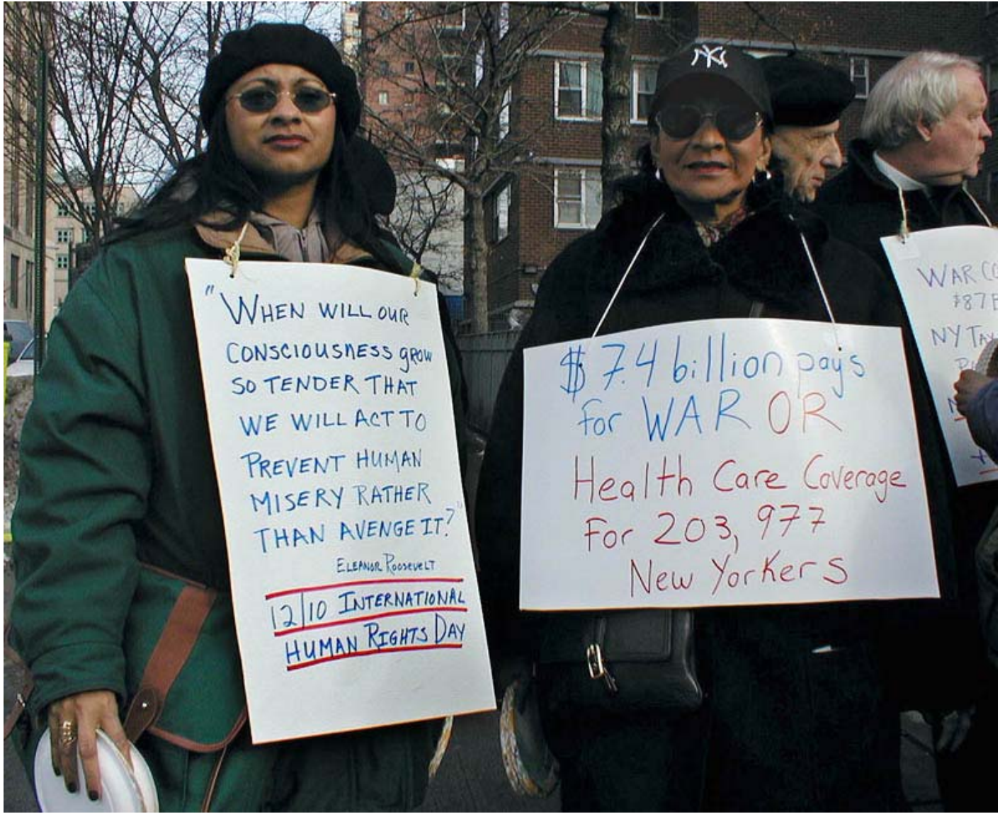
A mother and daughter speak out