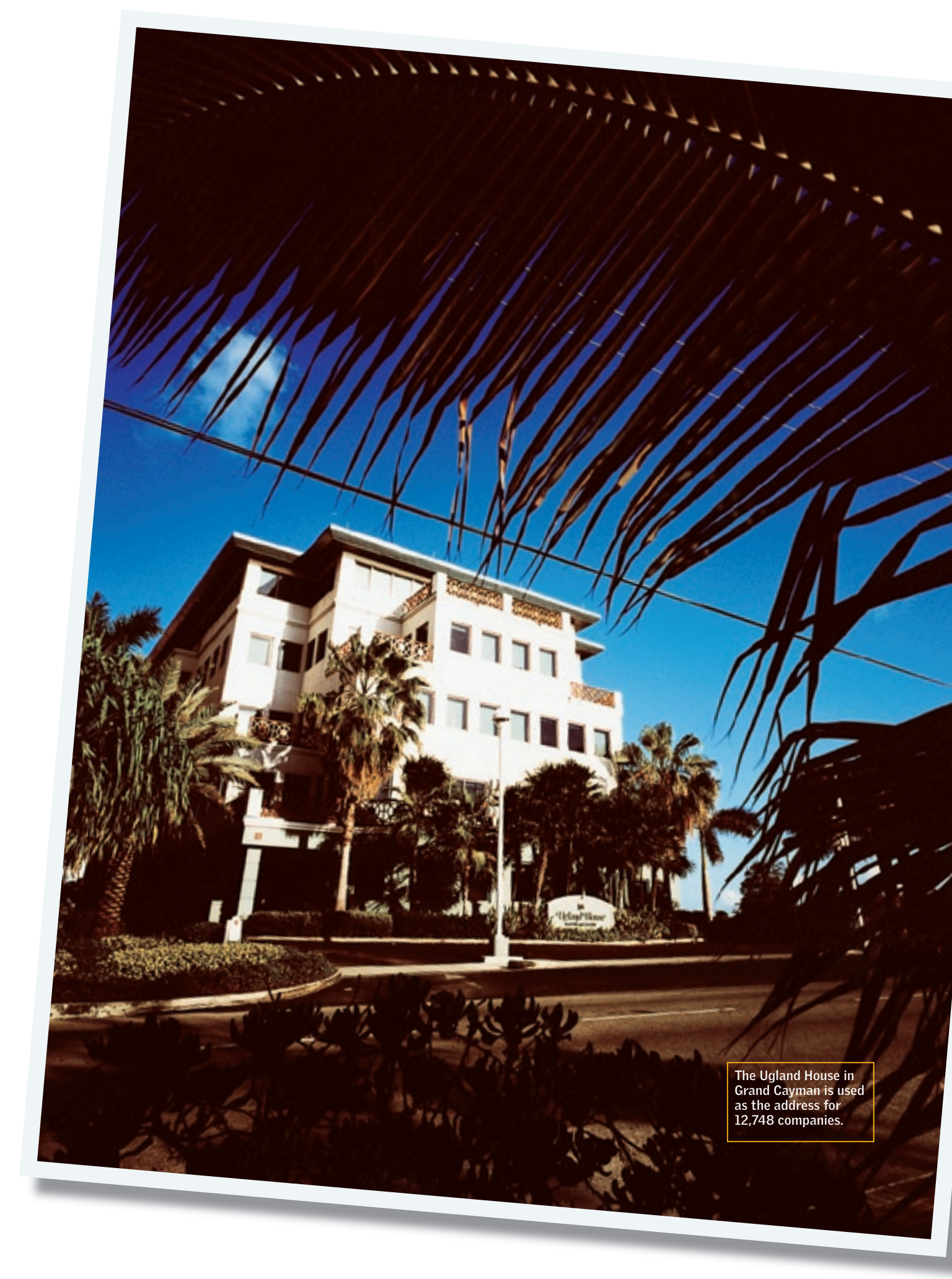
The Uglan House in Grand Cayman is used as the address for 12,748 companies.