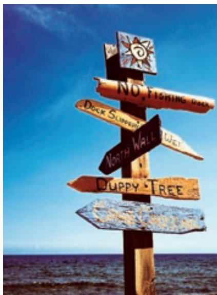
The Cayman Islands have about 40,000 residents and the same number of companies.

The Caymans provide near-total financial secrecy for companies, banks and accounts. There are more than 500 banks and trust companies with deposits of more than $1 trillion in the Cayman Islands, according to the Cayman