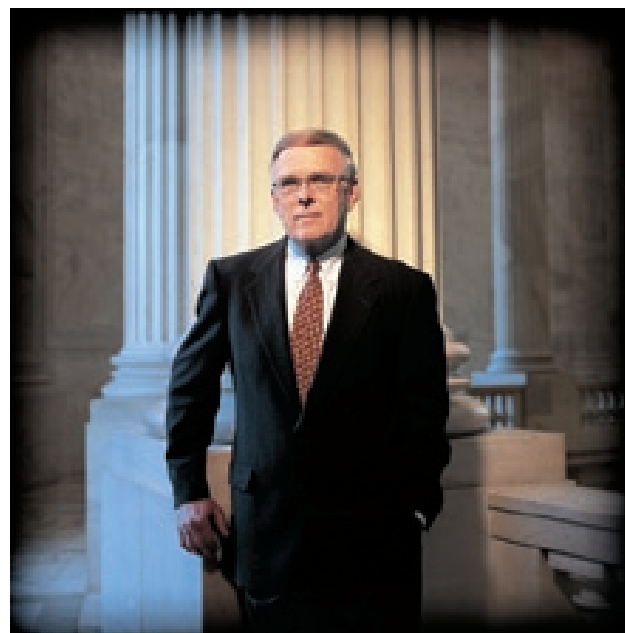
U.S. Senator Byron Dorgan says too many companies abuse accounting rules to avoid taxes.

James Investment, based in Beavercreek, Ohio, holds 24,000 shares of Seagate Technology Inc., the world's largest computer disk drive maker. Seagate, based in Scotts Valley, California, incorporated in the Cayman Islands in 2000. The company reduced its taxes in fiscal 2003 to an effective rate of 2.9 percent, or $19 million on profit of $660 million, according to its 2003 annual report. Seagate's taxes included foreign taxes paid of $40 million and a U.S. tax credit of $21 million, according to the report.